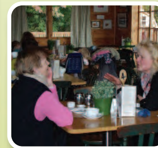
Bradley Burn Café

From Bradley Burn Farm Shop, head south across the main road and follow the public footpath to the railway. Follow the public footpath west between the river and the railway to Wolsingham. There are a number of good pubs, cafes and restaurants in Wolsingham.