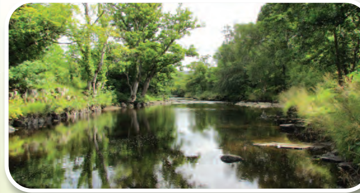
The River Wear

www.bradleyburn.co.uk Tel: 01388 529488 Summer Opening Hours 9am - 5pm 7 days a week Winter Opening Hours 9am - 4pm CLOSED SUNDAY