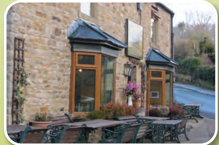
The Black Bull at Frosterley

Useful Maps 1:25,000 Outdoor Leisure 31 North Pennines 1:25,000 Explorer 305 Bishop Auckland