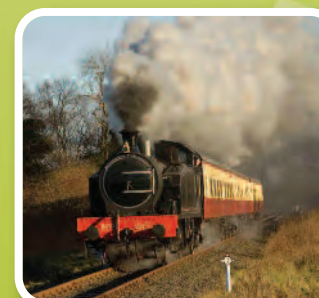
Steam Train on Weardale Railway

Leave Frosterley and head south across the river bridge, turning west along the minor road to Stanhope. At Stanhope, cross the railway and the river and enter the village at the east end. There is a good selection of tea rooms and pubs in Stanhope.