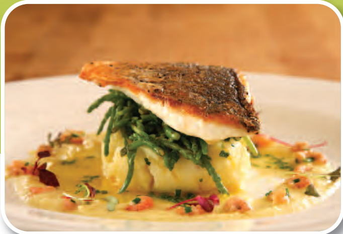
Local fish lunch

Terrain - This route follows public rights of way, so has some unsurfaced sections. There are some stiles, steps and steep gradients. At all times please follow the Countryside Code. Dogs must be kept under close control (on a lead through fields with livestock), please also be sure to leave gates as you find them.