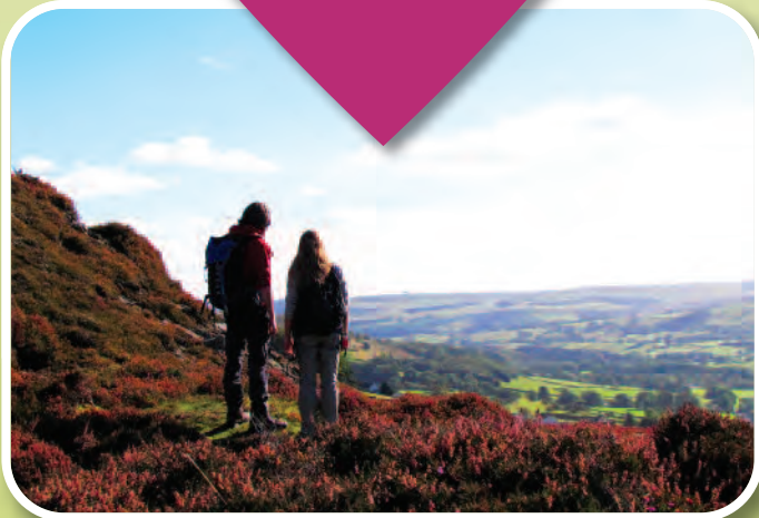
Walkers in Weardale

Route Introduction - This walking route is a linear trail that takes you along the course of the river Wear. You can return to the starting point using the train or bus. The route is an excellent way to experience the beauty of the dale that nestles below the open moors of the North Pennines Area of Outstanding Natural Beauty, while indulging in some great local food. Along the way you will pass through the pastoral lamb and cattle producing farmland of the dale. Remnants of the quarrying and mining heritage of the area lies all around as you follow the River Wear upstream.